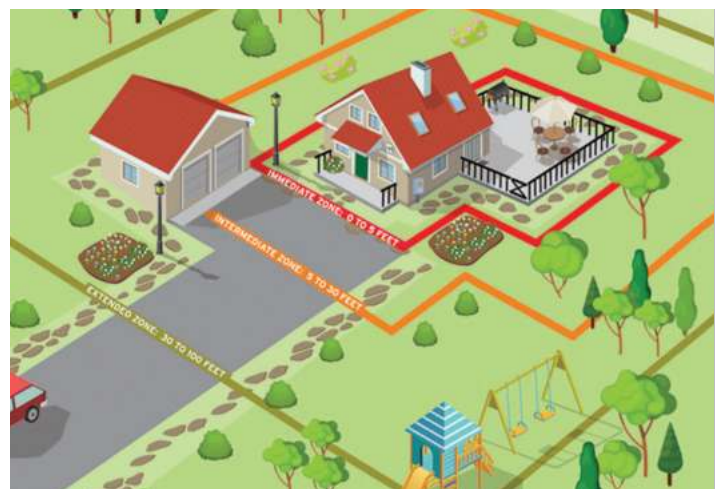
Rake and remove pine needles and dry leaves to a minimum of 3 to 5 feet from a home.